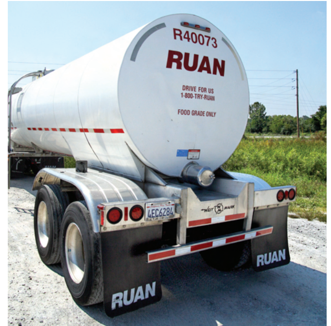
Ruan Transportation Management Systems light weight 6,400-gallon sanitary milk trailers that can handle a 53,000-lb payload. Lower trailer weight was achieved by eliminating the product pump, cabinet, and hose tubes.

"We believe we can extend the maintenance interval as we gain experience with these 42 tractors," Ashley says. "We are confident that the Cummins Westport engine will work well, and we believe this operation will help renewable natural gas fuel become the standard for the dairy industry."