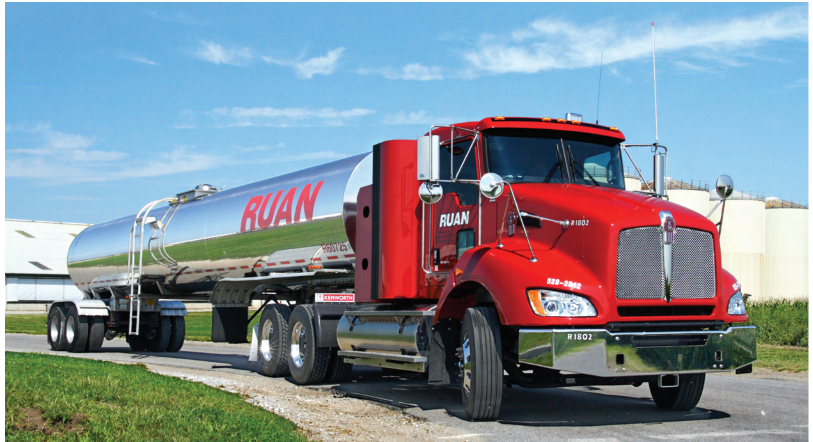
Operations are just getting under way for the new CNG-fueled milk hauling fleet at Fair Oaks Farms in Fair Oaks IN. With 42 Kenworth T440 tractors operated by Ruan Transportation Management Systems and leased from Paclease, it is being called the largest renewable CNG project in the United States. The operation also includes 80 milk tank trailers.