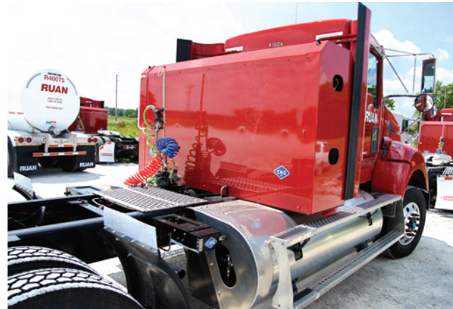
In addition to dual saddle tanks, two CNG fuel tanks are mounted behind the cab giving the Fair Oaks Farms tractors a range of almost 600 miles.