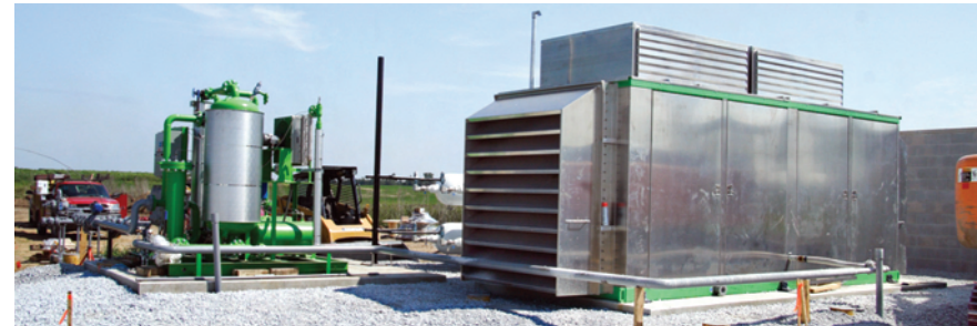
Fueling station equipment includes a compressor to compress the methane before it is pumped into the tractor fuel tanks.

Providing fuel for the operation was one of the biggest challenges. The natural gas fueling infrastructure simply does not exist in many states, including Indiana. In addition, Fair Oaks Farms wanted to supply most, if not all, of