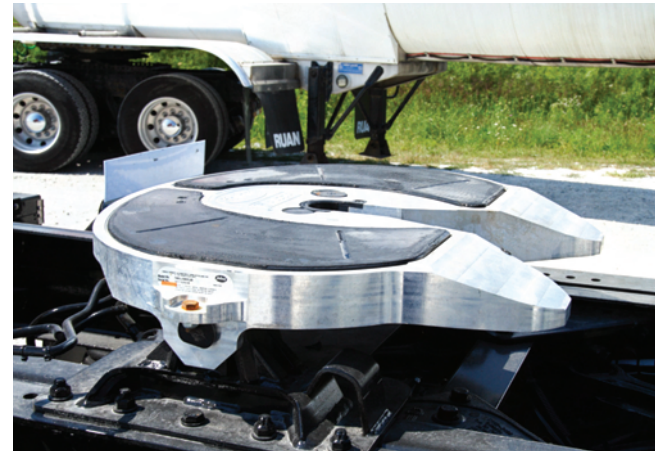
Weight-saving specifications include Holland's aluminum fifth-wheel.

Understandably, participants in the fleet operation will keep a close watch on the tractors. All tractor maintenance will be handled by Palmer PacLease, the local PacLease franchise. Maintenance is being done at the Fair Oaks Farms fleet facility