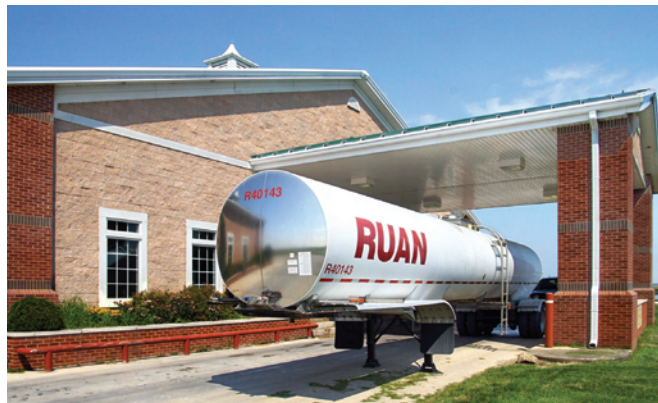
Fair Oaks Farms personnel preload Ruan milk tankers at some of the Fair Oaks dairy farms, but Ruan drivers handle loading at other locations.

Working with PacLease, Fair Oaks Farms managers agreed on a tractor specification that they believe will meet their need to handle an 80,000-lb gross combination weight and haul a maximum payload. They chose the Kenworth T440 daycab tractor with a nine-liter Cummins Westport ISL G engine rated at 320 horsepower, Allison 3000HS six-speed automatic transmission, and four CNG fuel tanks that hold the equivalent of 130 gallons of diesel. As spec'd