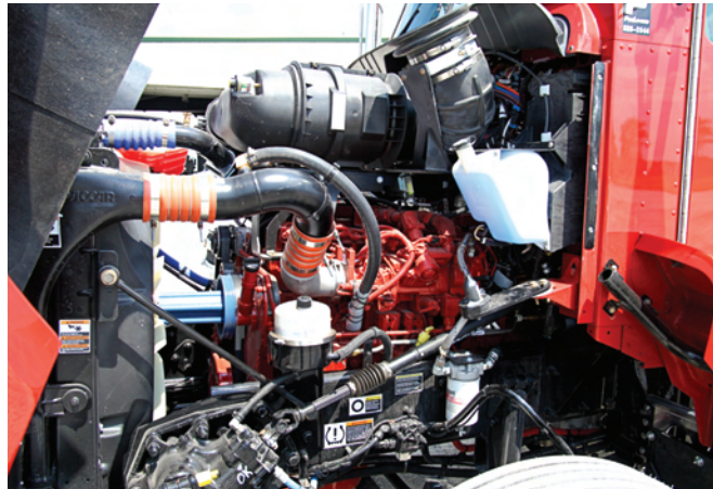
Fair Oaks Farms and PacLease chose the 320-hp Cummins Westport ISL G engine for the CNG-fueled tractors.