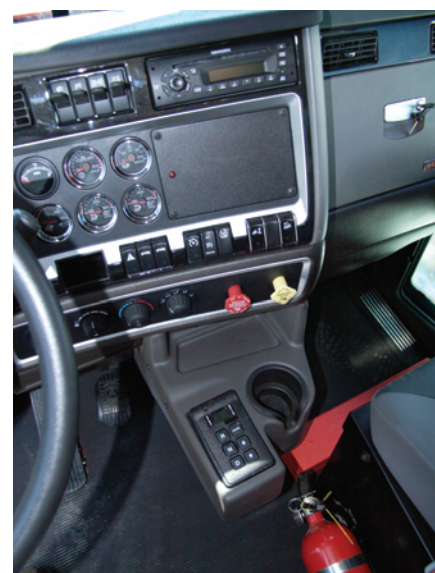
Kenworth T440 tractors in the Fair Oaks Farms fleet were spec'd with the Allison 3000HS six-speed automatic transmission.

Open to the public, the CNG filling stations are fully equipped to compress and dispense CNG. The CNG filling stations have a rated capacity of 50,000 cubic feet per hour.