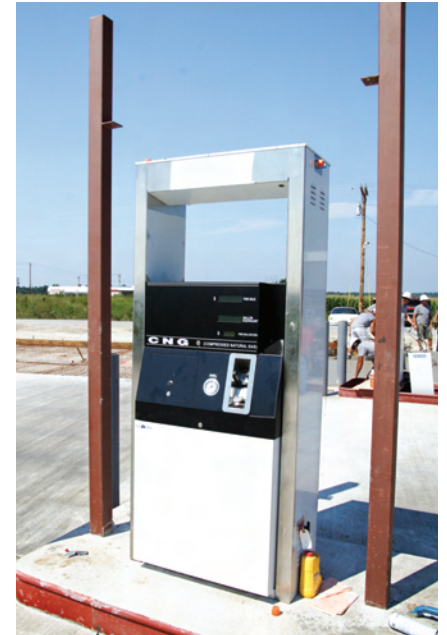
Launching the new CNG-fueled tractor fleet at Fair Oaks Farms also meant building the support infrastructure, including two fueling stations constructed and operated by Clean Energy Fuels Corp.

"We're still in the process of upgrading the digester, and that project