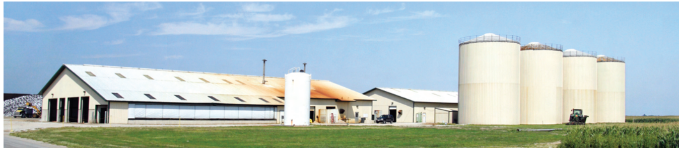
A Fair Oaks Farms digester similar to the one housed by the building in this photo is used to produce methane to fuel the 42 tractors in the fleet. Methane is released during the anaerobic treatment of cow manure, collected, and scrubbed to remove CO2 and hydrogen sulfide. The end result is fuel-quality methane.