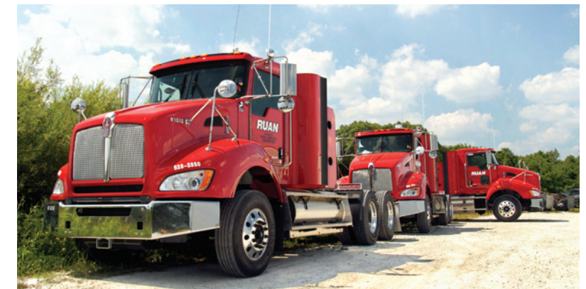
Pictured are three of the first four CNG-fueled tractors that were delivered to Fair Oaks IN-based Fair Oaks Farms. The tractors are on a full-service lease from PacLease.

"Federal and state grants helped offset the higher cost of the CNG-fueled tractors and the cost of building two CNG filling stations," Stoermann says. "At this point, it still takes incentives to justify the initial investment natural gas fueled vehicles. We have to do better than break-even."